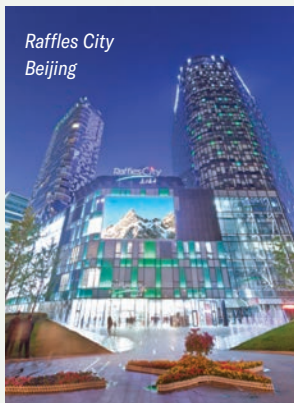
Raffles City Beijing